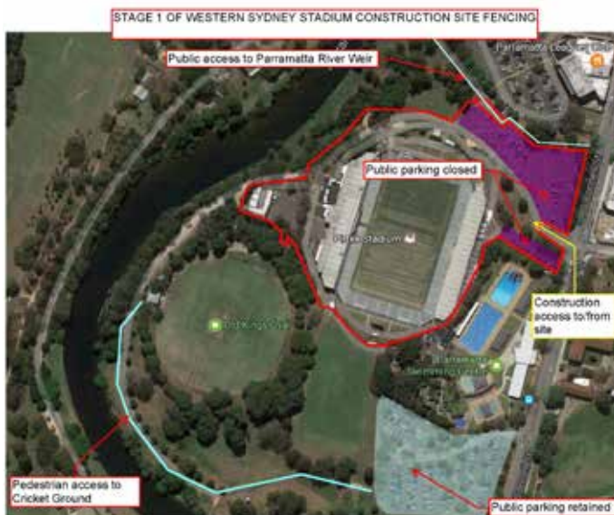
Map data: Google

The following diagrams represent the current site boundary and the total site boundary once the pool is vacated at the start of April.