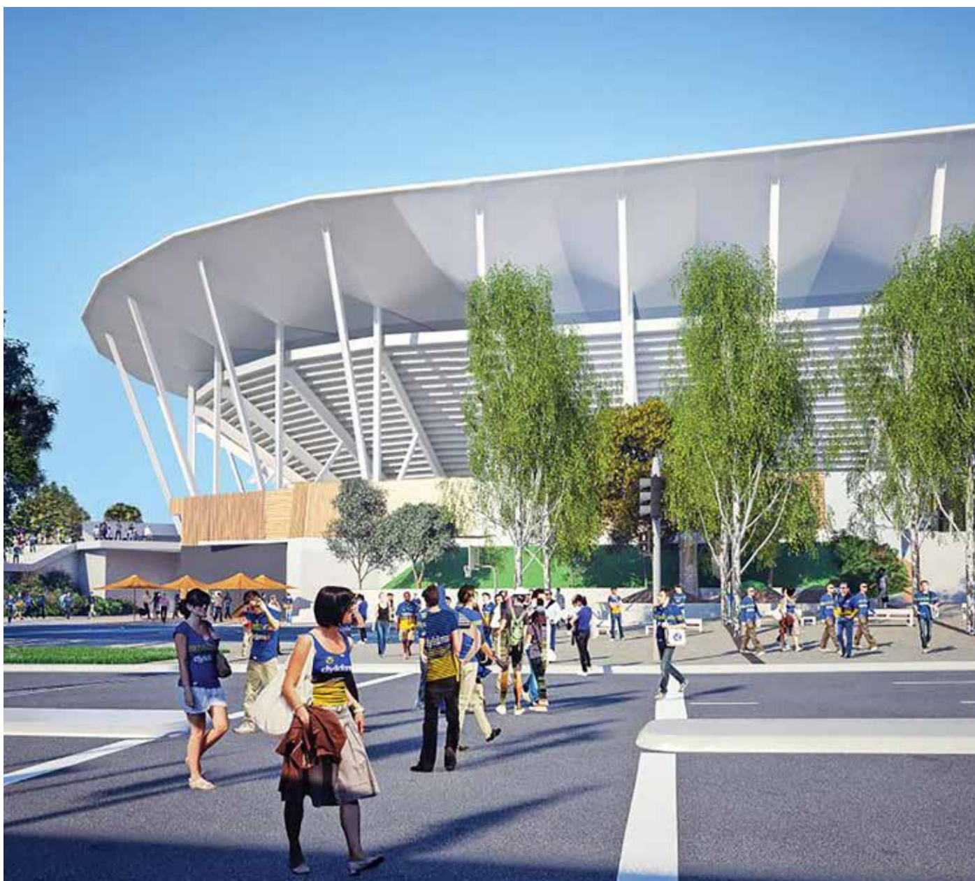
Artist impression of the new stadium

For more information on the Mays Hill Precinct Master Plan, being developed by the Parramatta Park Trust please contact the Trust on 02 9895 7500 or email info@ppt.nsw.gov.au