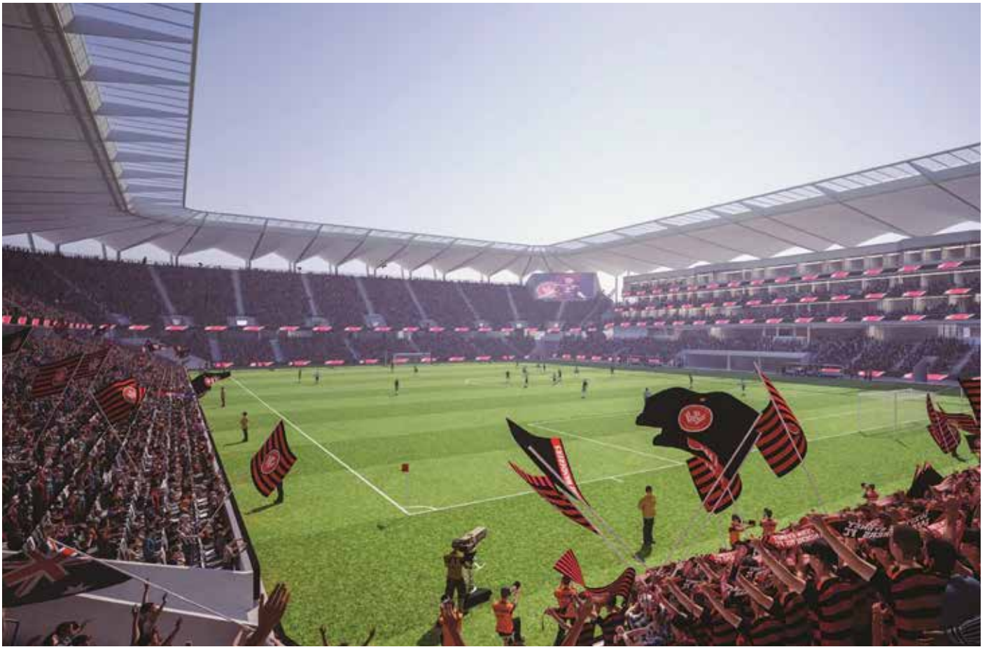
Artist impression of the new stadium