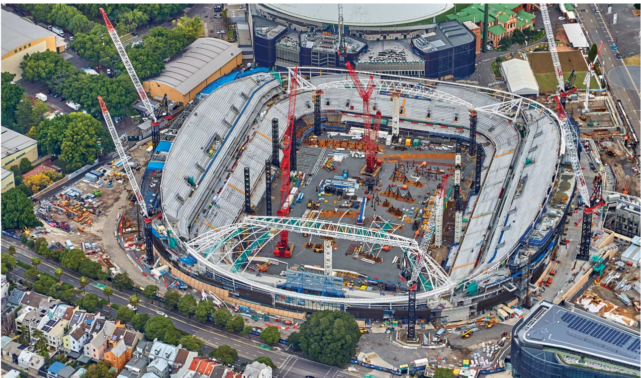
Construction progress at the Sydney Football Stadium

There are 980 curtain wall panels that surround the external façade. If placed end to end, the panels would reach over 1.7km.