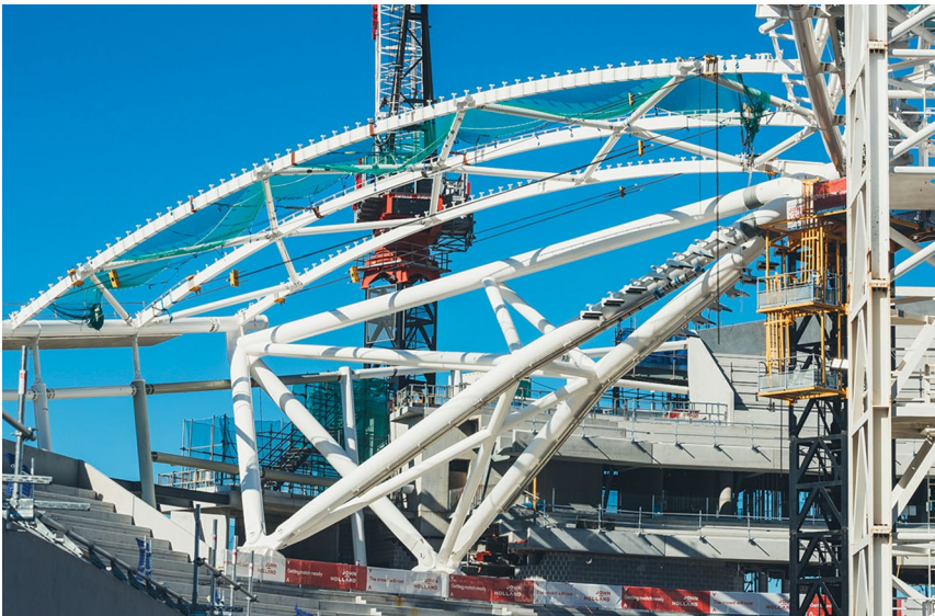
A section of the roof's diagrid lifted into place