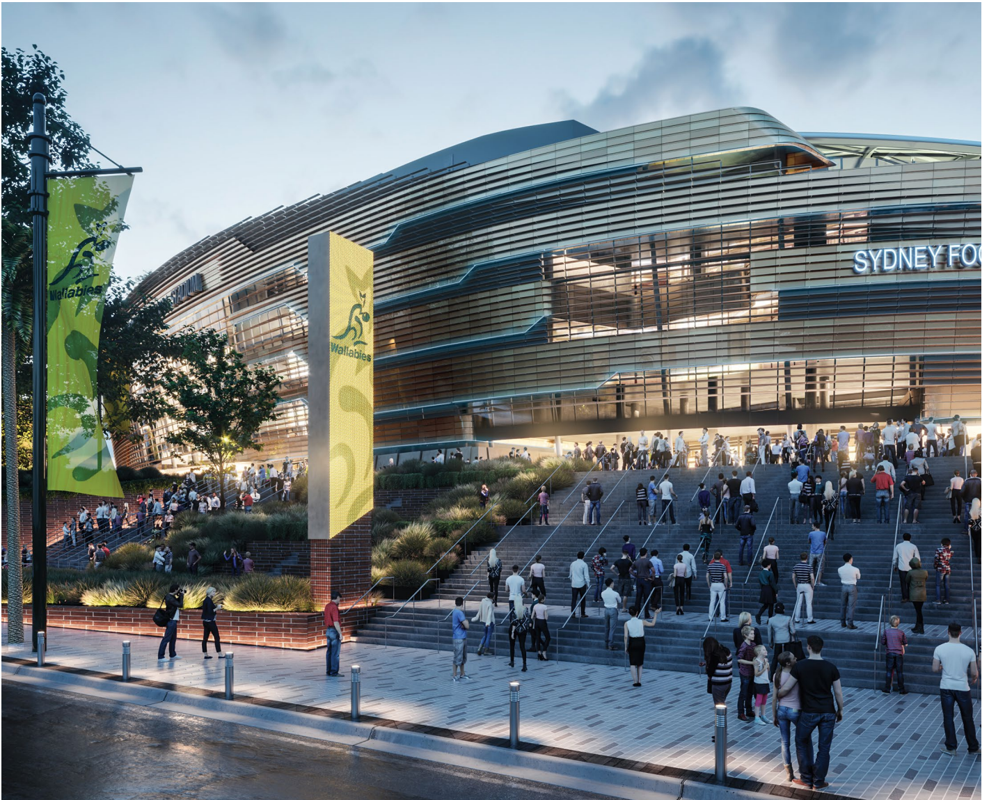
Artist impression of the new Sydney Football Stadium

The NSW Government is redeveloping the Sydney Football Stadium into a modern, world-class venue, to ensure Sydney has a sporting and entertainment precinct of an international standard and that NSW remains the number one choice for sporting and entertainment events.