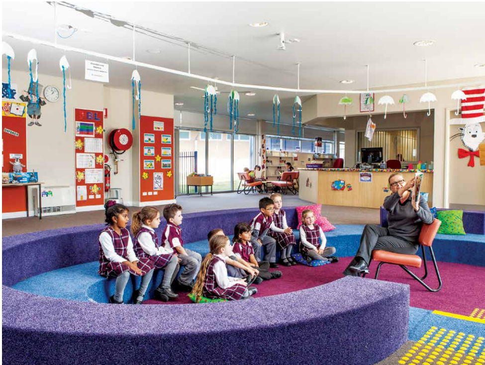
Figure 7.2 Closing the gap